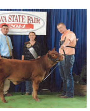
Reserve Champion Bull, DLCC Two Step 84B, a 5/12/14 son of DLCC Shur Loc 99W, shown by DLCC