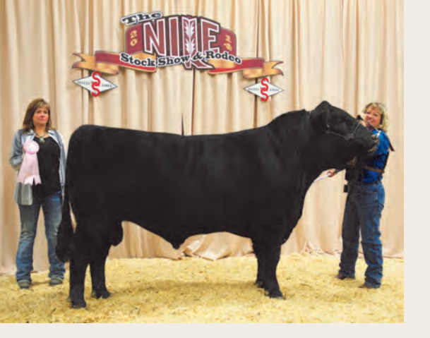
Wildcat, a purebred South Devon Bull was Reserve Senior in the AOB division at the 2014 NILE, shown by Superior Land & Livestock, Lincoln, CA.

show will be held October of 2015 during the North American International Livestock Exposition (NILE) in Billings, MT. The event will feature a South Devon show. Poundmaker show and South Devon junior show. Scholarships will be awarded during the Showdown Barn Party, with entertainment following the event.