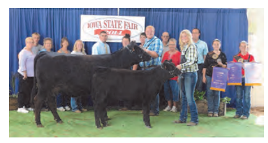
Reserve Champion Female, JVM Zella 203Z, a 3/27/12 daughter of MVM Sargent 654S, shown by JVM Cattle Co., Pella, IA.