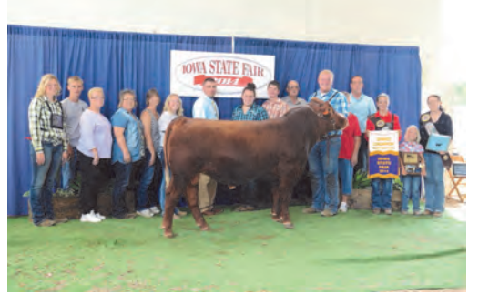
Grand Champion Bull, KNN Country Boy 15A, 4/7/13 son of KNN Ranger 37T, shown by JVM Cattle Co., Pella, IA.